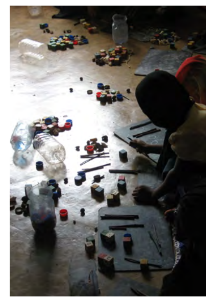
RISE uses locally developed learning materials, which can be collected for little to no cost. These materials are also used to teach math, literacy and life skills.

Baseline and outcome tests were administered to treatment and control group samples of Standard One-level students to assess learning gains as a result of RISE's IRI activities. Treatment and control group students were comparable, except that treatment students also received the IRI programs. Any difference in test scores between the treatment (IRI students) and the control (non-IRI students) students can thus be attributed to the IRI program. Results show that RISE's IRI beneficiaries outperformed control students by 7.5 points out of 75 total points (or 10%), overall.<sup>1</sup> The greatest subject gains were made in Kiswahili. Test scores rose by approximately 3 points, on average, as a result of RISE interventions, over and above scores for control students. Progress is also evident in English and math results, where scores have risen by about 2 and 2.5 points, respectively, for treatment students over and above gains made by control group students. When comparing results by gender, student learning gains among treatment girls are shown to be greater than gains made by boys, demonstrating that IRI programming is girl-friendly and inclusive.