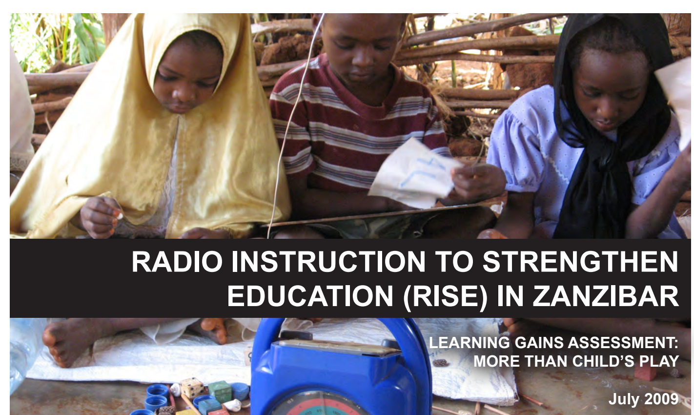
Students at a RISE learning center, who now have access to an early childhood education.