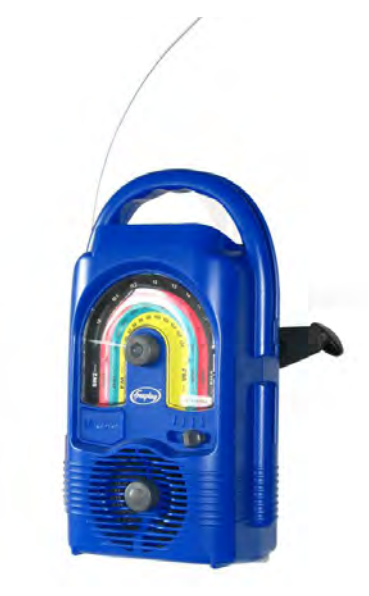
The radio is the key medium of instruction for reaching RISE's remote and underserved communities. This cost effective radio is solar and wind-up powered, and it is resistant to inclement weather.

Results show that a variety of complementary factors play a role in positively affecting test score gains. Preschool education emerges as the most influential of these factors. Students who had previously attended preschool scored nearly 4 points higher, on average, than their counterparts who did not attend preschool. This result is evident, to varying degrees, across groups, disciplines, genders, and districts, regardless of whether this early childhood education took place in an IRI formal or non-formal preschool setting. This finding supports Zanzibar's Ministry of Education and Vocational Training's policy initiative of making preschool education a mandatory component of the basic education system, and it further reinforces the need for projects such as RISE that increase access to and quality of preschool provision in Zanzibar.