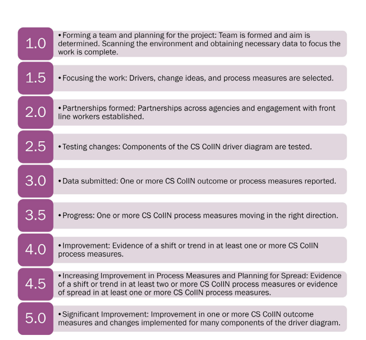
Figure 2 The CS CollN Progress Scale note 1. The CS CollN Progress Scale was adapted from the IHI BTS model.<sup>29</sup>

along process measures within 1 year. This was achieved through application of the CS CoIIN framework that utilized the collective impact approach, 11 BTS, 9 and MFI8 with three key adaptations. The first adaptation was to broaden the group of stakeholders who develop the driver diagrams and measurement strategies to include both subject matter and application experts from the National Coordinated Child Safety Initiative Steering Committee, CSN, HRSA and state/jurisdiction practitioners in order to address the challenge of translating research into practice across multiple injury and violence prevention topics. The second adaptation was to use a blended delivery model that replaced two face-to-face learning sessions with 4-hour virtual meetings, to facilitate increased participation. A third adaptation that emerged midway through the CS CoIIN was creation of a CS CoIIN progress scale to reflect working in a complex, multisectoral environment at the population health level. The scale recognizes early work should focus on states/jurisdictions aligning CS CoIIN activities with strategic plans, scanning and assessing their environments and building partnerships.<sup>8</sup>