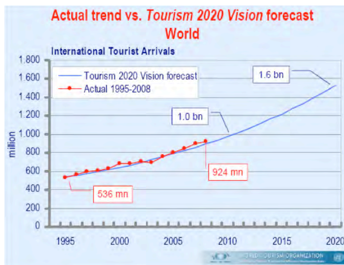
Figure 1: Projected Tourism Growth