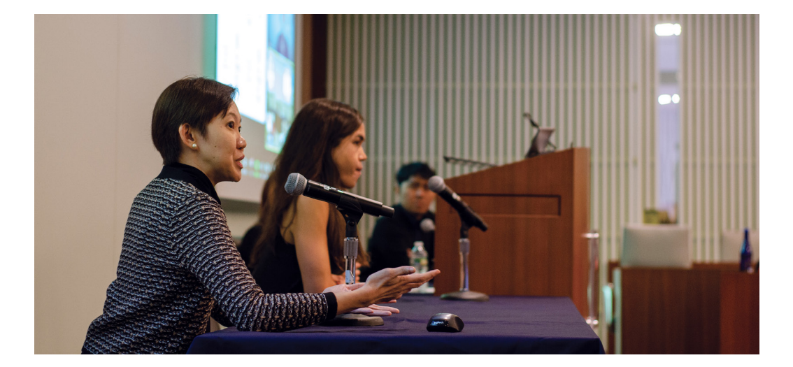
Indonesian youth are aware of what is happening in climate change, and the talent is there. We just need to mobilize it!

Overall, panelists concluded that governments need to support education institutions to better anticipate skill needs. The private sector needs to support continuous upskilling and reskilling of their workforce. To ensure the necessary pace of change, additional dialogue and collaboration are needed between government, the private sector, and education institutions.